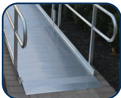
Interchangeable BTP and end loops