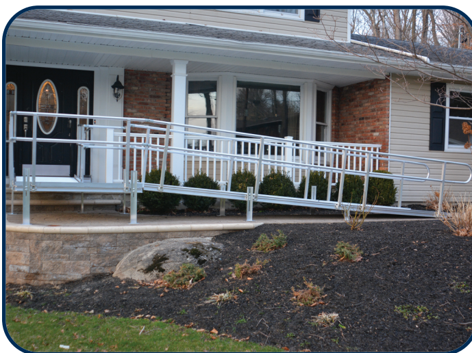
Sleek modern design