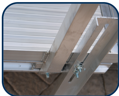
Easy adjustable leg design