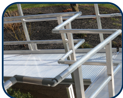
Continuous handrail design